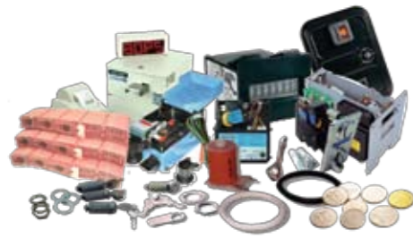
• Tokens, Tickets, Coin Mechs & Accessories