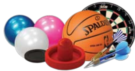
• Machine Consumables