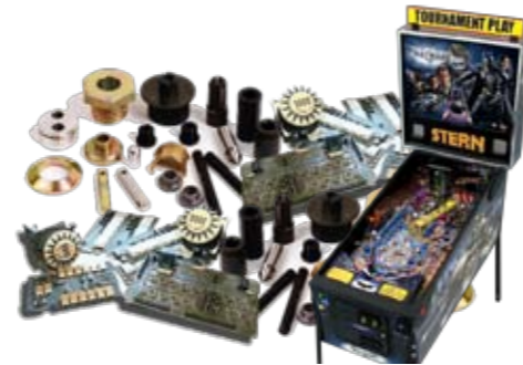
• Pinball Machine Parts