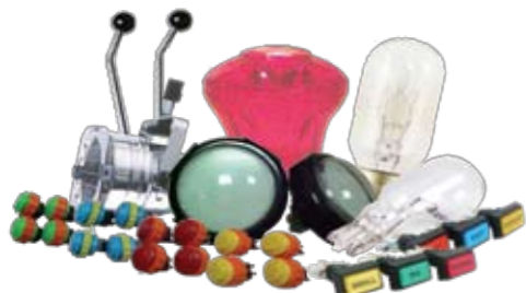
• Buttons, Bulbs & Lamps