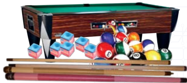
• Billiards Accessories