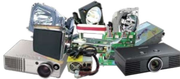
• Video, Power, Projectors & Lamps