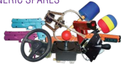
• Control Units