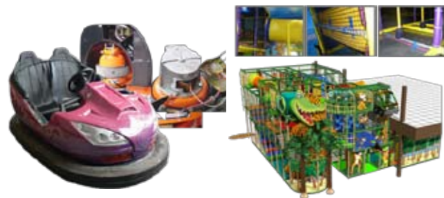
• Spares for Play Area, Rides & Attractions