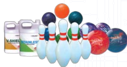
• Bowling Accessories