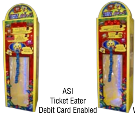
ASI Ticket Eater Debit Card Enabled ASI Ticket Eater With Print Receipt